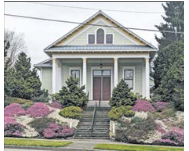
Thumbnail Theater is located at 1211 Fourth Street in Snohomish.

The Thumb also hosts a weekly Friday Night Open Mic, a bi-monthly Ukulele Community of Joy, Summer Musical Theater Camp, and is available for rental for performance recitals,