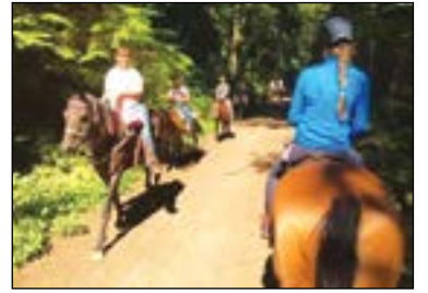
Equestrian trails at Lord Hill Park (Friends of Lord Hill)