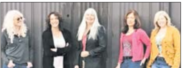
Moon Candy Band (Rock/Americana) will perform Monday, Sept. 1 at 10:45 a.m.