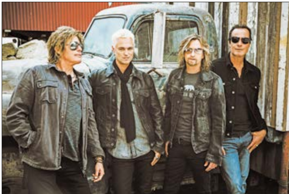
Stone Temple Pilots will take the stage Friday, Aug. 30.

For more information visit EvergreenFair.org.