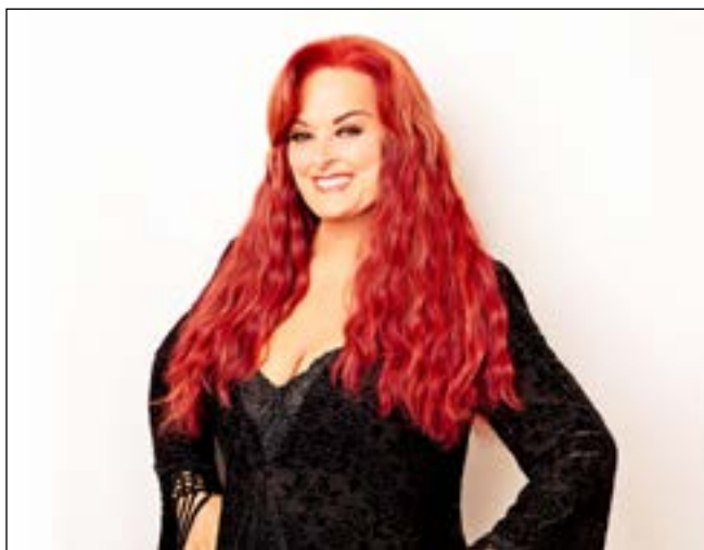
Wynonna Judd performs Monday, Aug. 25 as part of her Greatest Hits Tour.

The Evergreen State Fair has announced the much-anticipated Grandstand Stage concert line-up for 2025: