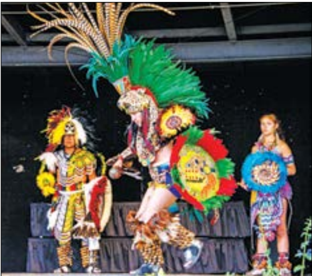
The Aztec Indian Dancers will perform Friday, Aug. 22 at 3:45 p.m. and on Monday, Aug. 25 at 4:30 p.m.