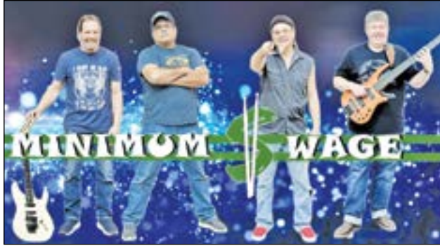
The Minimum Wage Band (Classic Rock, Country, and Blues Rock) will be on stage Friday, Aug. 22 at 8:30 p.m.

The Evergreen State Fair offers a wide array of talent at the Courtyard Stage. (#514 on the Map on Page 2) Schedule Subject to Change