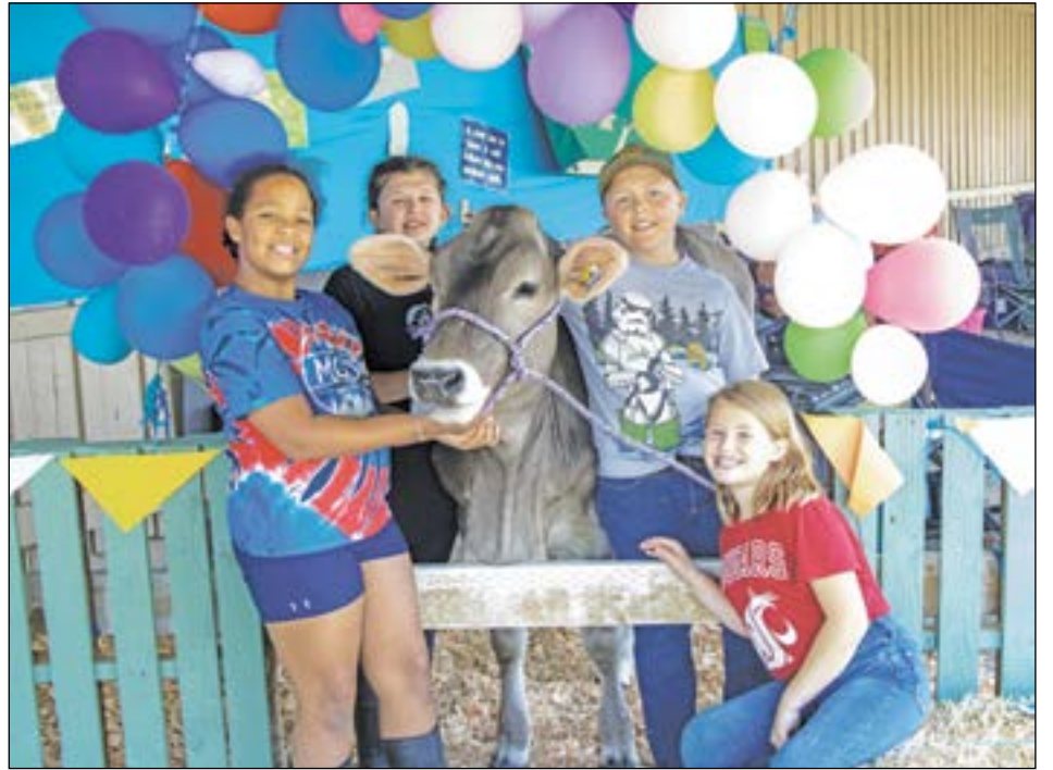
Many youth have shown their livestock over the years at the Evergreen State Fair.