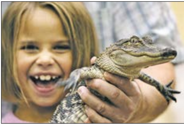
The Reptile Man will be wowing the crowds on Thursday, Aug. 28 at 11:00 a.m.

2:45 p.m. The Fentons (Country) 4:30 p.m. Square Dance Party (Mt. Baker Square Dance Council) 6:45 p.m. Dr. Owl's Magic Show 8:15 p.m. The Sound Guys (Classic Rock Duo)