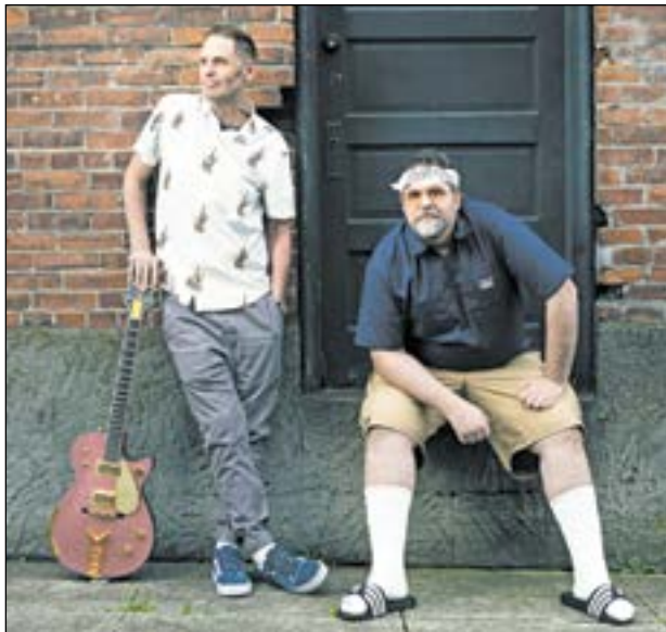
The Pilchuck Boyz (rock band) will perform Monday, Aug. 25 at 8:30 p.m.

10:45 a.m. Highlight Quartet (for Children) 12:00 p.m. Commander Mojo & The Horns of Discontent (Rock) 1:30 p.m. Infolkmotion Cloggers (Group Dance)