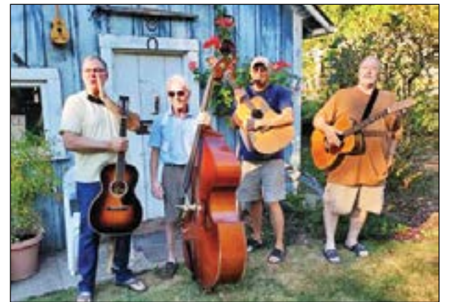
The Shed Players (roots/folk/blues) will perform Saturday, Aug. 23 at 4:30 p.m.