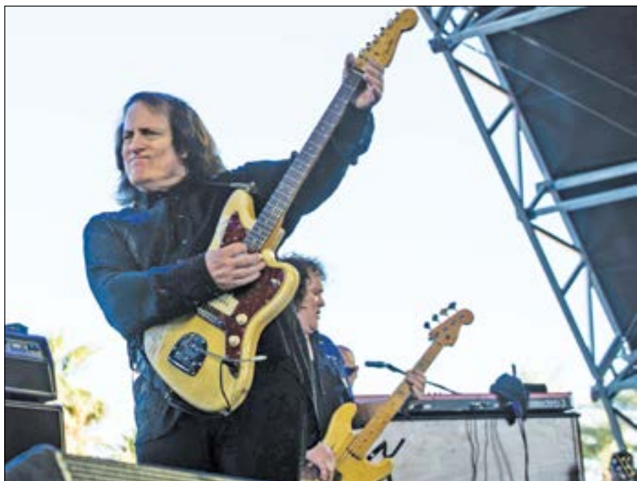
Tommy James and The Shondells will perform Tuesday, Aug. 26.