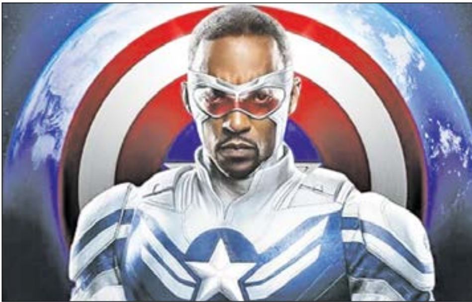
Captain America Brave New World will be showing Friday, August 22.