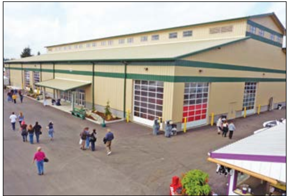
The Gary D. Heikel Event Center is a 33,000 square foot building with attached restrooms.

The fun at the Evergreen State Park isn't confined to just the Fair (Aug. 21-26 and Aug. 28-Sept. 1). No, the grounds are used all year round. There are animal shows, both domestic and farm; swap meets, collectibles and special interest shows such as quilt shows, woodcarving shows, hobby shows and craft markets, as well as the popular auto racing at the Evergreen Speedway.