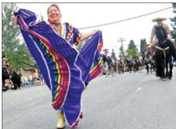
The Ixtapa Dancers and Dancing Horses are a crowd favorite at the Fair Days Parade. The 2025 Parade will be Saturday, Aug. 23 at 11 a.m. on Main Street.

May 4: Kaci Edelbrock Memorial 5K at Lake Tye Park, 10am, www.bigheartbigsmile.org