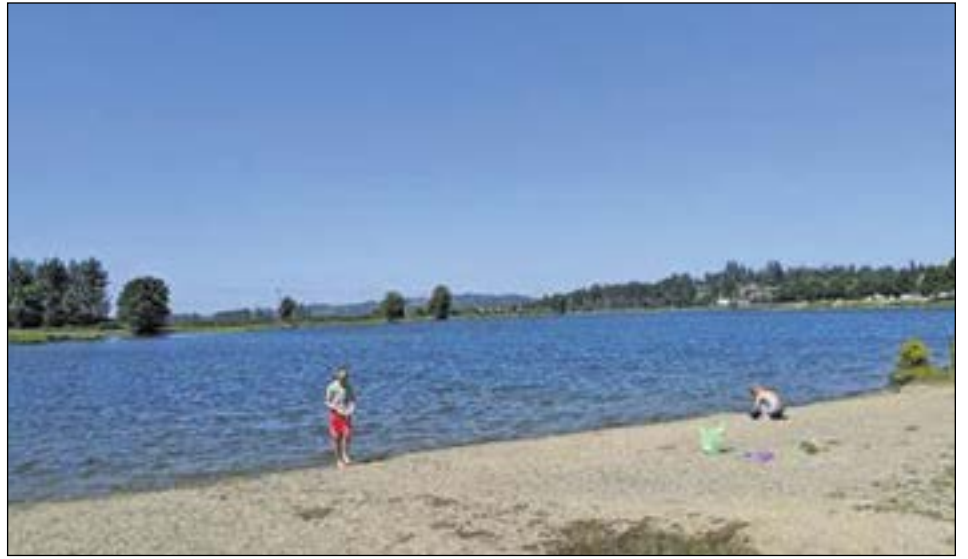
Lake Tye Park includes a non-lifeguarded beach and boat launch,

SkatePark: Located at Lake Tye Park, the skate park features six quarterpipes, three wedges, two funboxes and a host of grinding rails.