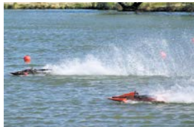
R/C Unlimiteds Model Boat Racing will be Sept. 7 on Lake Tye at 8 a.m.

July 19: Hawaiian DJ Bingo at Monroe Community Center, 276