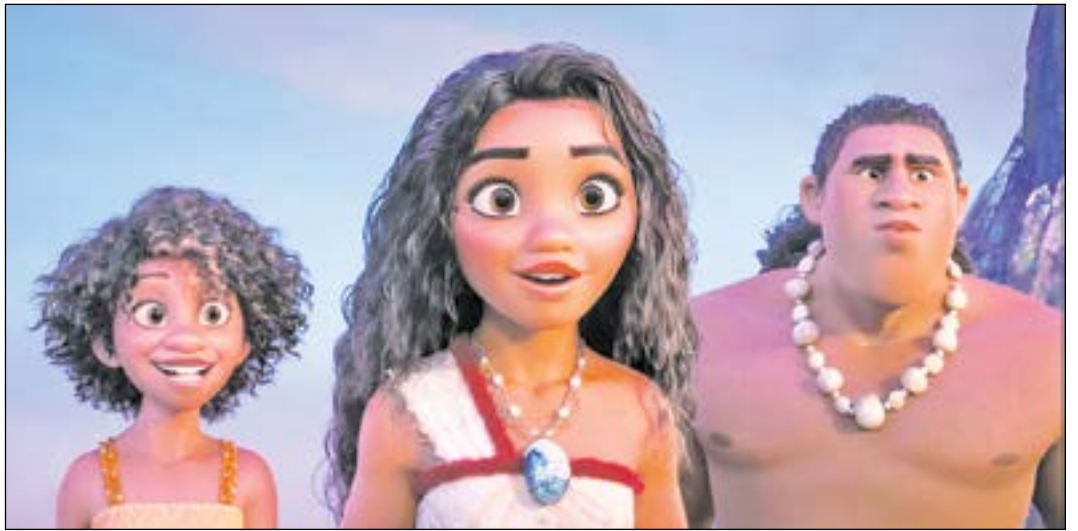
Moana 2 will be showing on Friday, August 8.