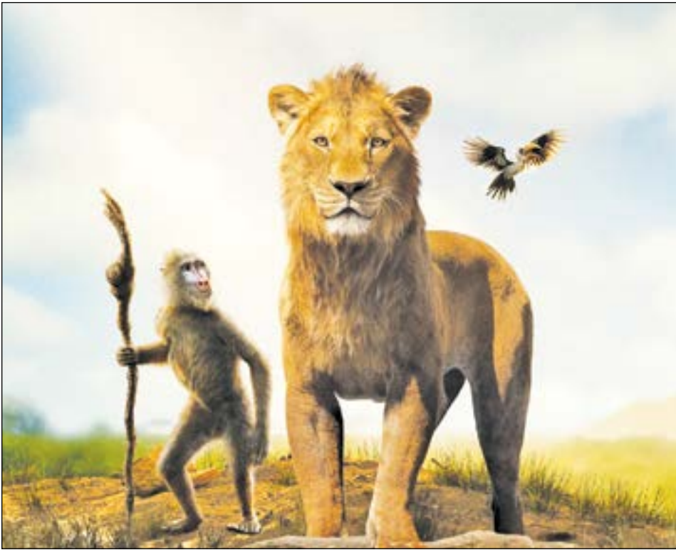
Mufasa The Lion King will be showing Friday, August 15