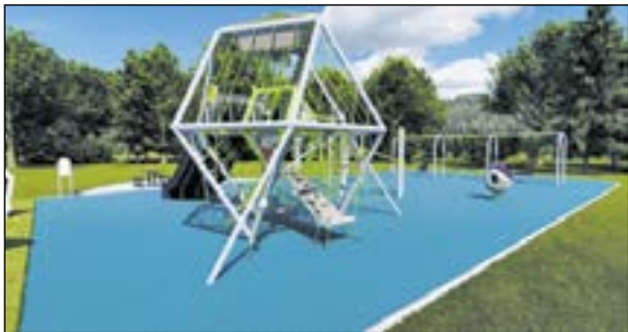
The new play equipment at Currie View Park includes features that: encourage multi-generational play; are ADA inclusive and intentionally break down physical and social barriers to play; and advanced climbing challenges and motion activities that appeal to older children. Improvements such as the use of ADA approved rubberized surfacing are also part of the playground design. The overall footprint of the play area is approximately three times larger than the previous play area.

• Wiggly Field: 413 Sky River Parkway ~ This is an off-leash dog park with benches and parking lot.