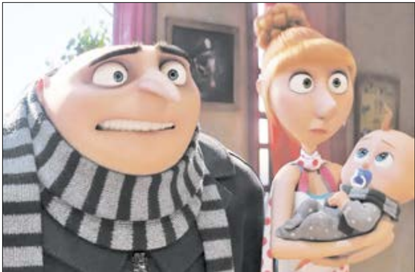
Despicable Me 4 will be showing on Friday, August 1.

Monroe Parks and Recreation will host four free movie nights at Lake Tye Park this summer. There will be pre-movie activities for kids at 8 p.m. and movies will begin at dusk (approximately 9 p.m.).