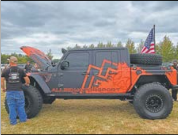
Allied Motorsport's Jeep Gladiator at the Field of Wheels event.