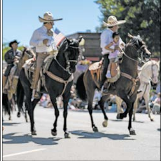
Ixtapa Dancing Horses in the Ha Ya Days Parade