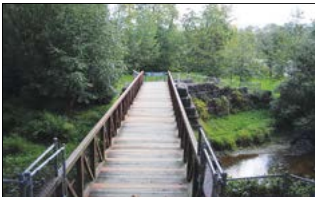
Al Borlin Park park is accessible by this footbridge from Lewis Street Park or by vehicle via Simons Road.

There are multiple pickleball courts offered at City Parks in Monroe. Pickleball continues to grow in popularity in all age groups.