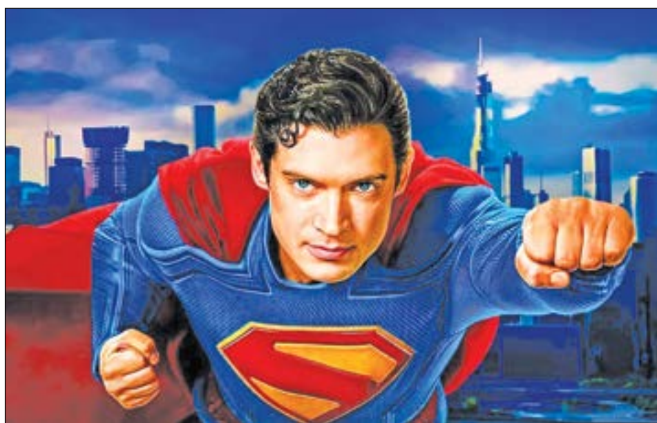
Superman will be shown Friday, August 21.