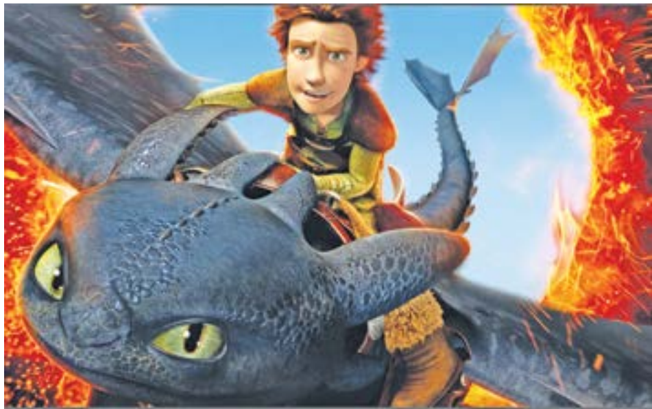
How to Train Your Dragon will be shown Friday, August 28.