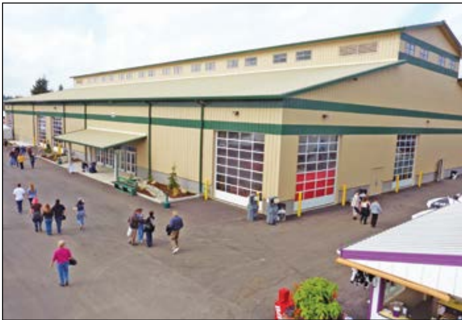
The Gary D. Heikel Event Center is a 33,000 square foot building with attached restrooms.

The fun at the Evergreen State Fair Park isn't confined to just the Fair (Aug. 27 - Sept. 1 and Sept. 3-7). No, the grounds are used all year round. There are animal shows, both domestic and farm; swap meets, collectibles and special interest shows such as quilt shows, woodcarving shows, hobby shows and craft markets, as well as the popular auto racing at the Evergreen Speedway. Are YOU planning an event? If so, the Evergreen State Fair Park can provide a unique venue to host your activity. With 194 acres, 14 buildings, top notch equestrian facility, ample parking and RV camping, the Evergreen State Fair Park has something for everyone! The Fair Park is centrally located with easy access from Highway 2 and Interstate 522 with nearby hotels, businesses and restaurants making it very convenient for exhibitors and attendees. Meetings, conventions, conferences, trade shows, social events, animal shows, equine events – when people gather, the Evergreen State Fair Park is the perfect location! The Fair Park prides itself on exceptional customer service and welcomes you to check out their facilities! Want to attend an Event? – Check out their Calendar of Events at www.EvergreenFair.org to find out dates, hours, locations and contact information.