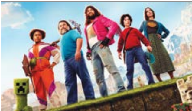
A Minecraft Movie will be shown August 7.

Monroe Parks and Recreation will host four free movie nights at Lake Tye Park this summer. There will be pre-movie activities for kids at 8 p.m. and movies will begin at dusk (approximately 9 p.m.).