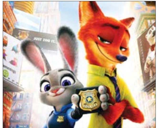
Zootopia 2 will be shown August 14.