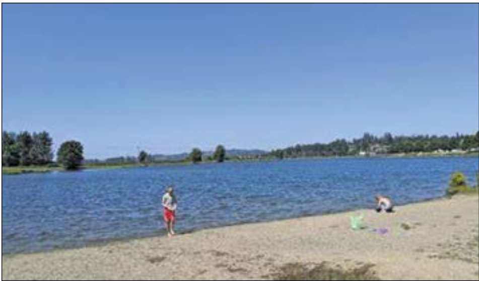
Lake Tye Park includes a non-lifeguarded beach and boat launch,

SkatePark: Located at Lake Tye Park, the skate park features six quarterpipes, three wedges, two funboxes and a host of grinding rails.