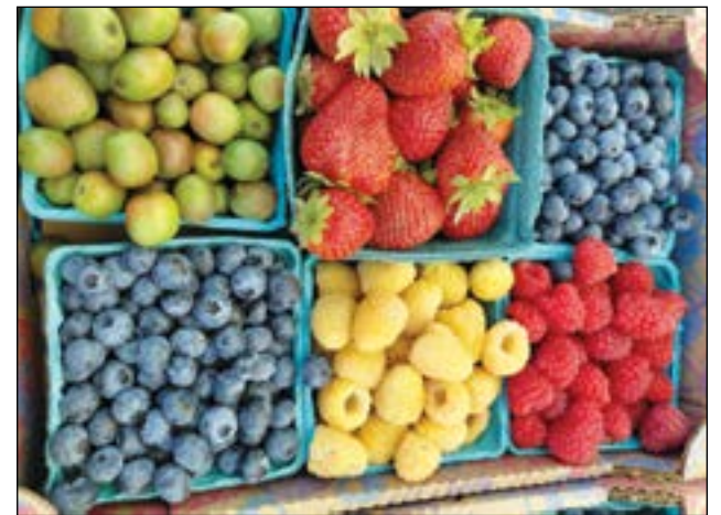
The Monroe Farmers Market is every Wednesday from May 27 through October at the Galaxy Theatre parking lot.

Aug. 4: National Night Out Against Crime at Lake Tye Park, 5:30-8:30pm