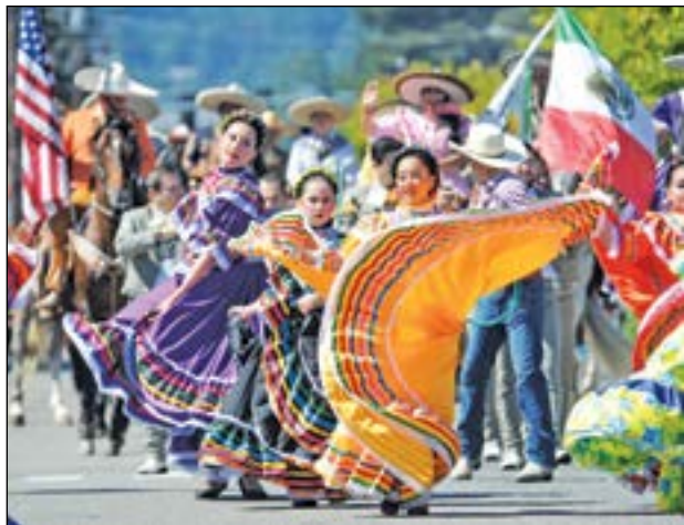
The Ixtapa Dancers and Dancing Horses are a crowd favorite at the Fair Days Parade. The 2026 Parade will be Saturday, Aug. 29 at 11 a.m. on Main Street.